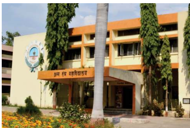
College of Food Technology