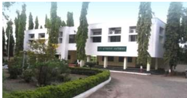
College of Agricultural Engineering

The College of Agricultural Engineering and Technology was established on 23 rd November 1986. College of Agri. Engineering is actively involved in research on modern irrigation systems, implements and tools for small and marginal farmers, value addition in different products, soil and water conservation and watershed management, and agricultural professionals for enhancing socio-economic status of farmers. The college implemented various ICAR-Adhoc projects as well as NATP, RKVY, NAHEP and other externally funded project.