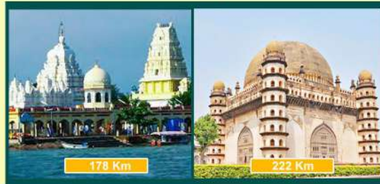
Lord Basavanna Temple (Kudala Sanghama)