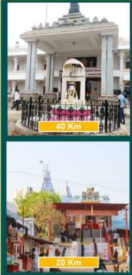
Panchamuki Hanuman Temple Shri Raghavendra Swamy Temple

Raichur is located at 16.2°N 77.37°E near the Western Ghats. The city is between Krishna and Tungabhadra rivers famous for Paddy, Cotton, Chilli, Engineering Industries, Agricultural Research and Education. The weather at Raichur during November will be pleasant temperature from 19°C to 32°C. Raichur is well connected by Rail and Road to all major cities in India and the nearest Airport is RGI airport, Hyderabad (180 kms).