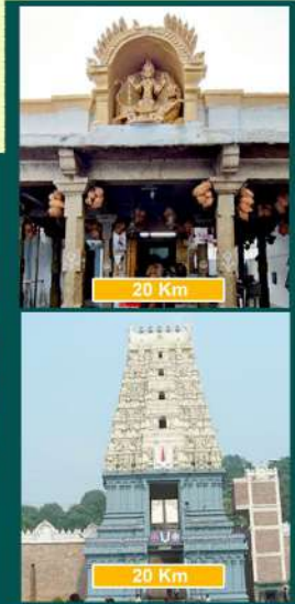
Shri Mahalaxmi Temple (Kalluru) Lord Shiva Temple (Devasuguru)