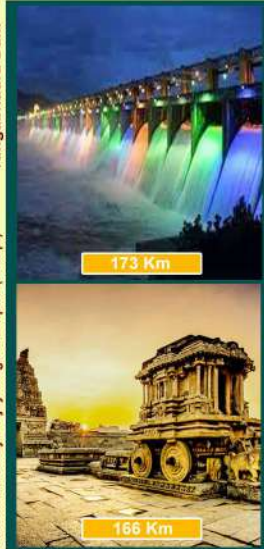
Sri Krishnadevaraya Vijayanagara Empire (Hampi)